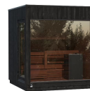
Kirami FinVision® -sauna M Misty (Left), Harvia Virta Combi 10,8 kW