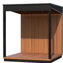
Kirami FinVision® -terrace M Misty