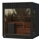
Kirami FinVision® -sauna M Misty (Right), Harvia Virta Combi 10,8 kW